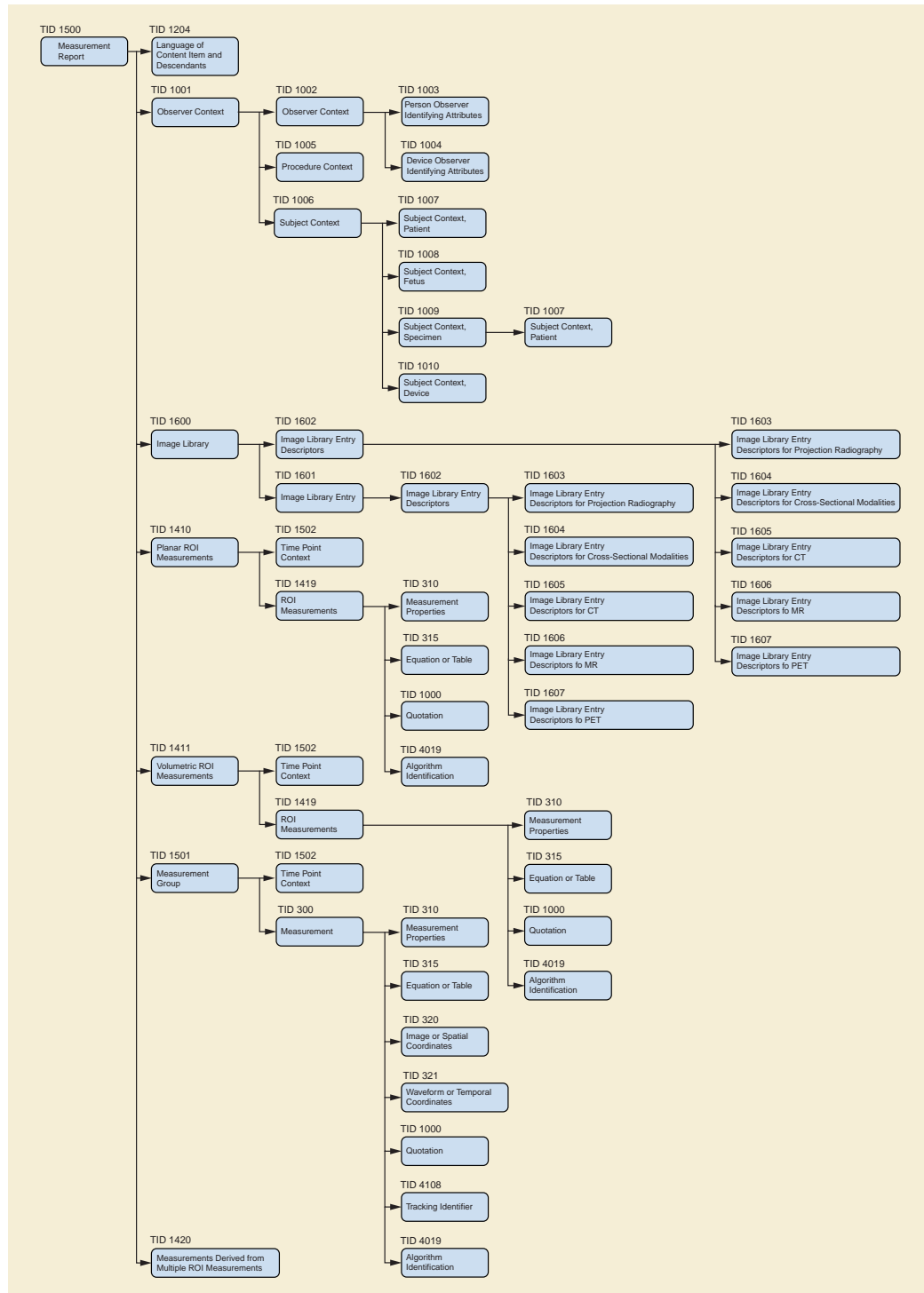
Figure A.3.2.1-1. Template Structure Summarized from PS 3.16